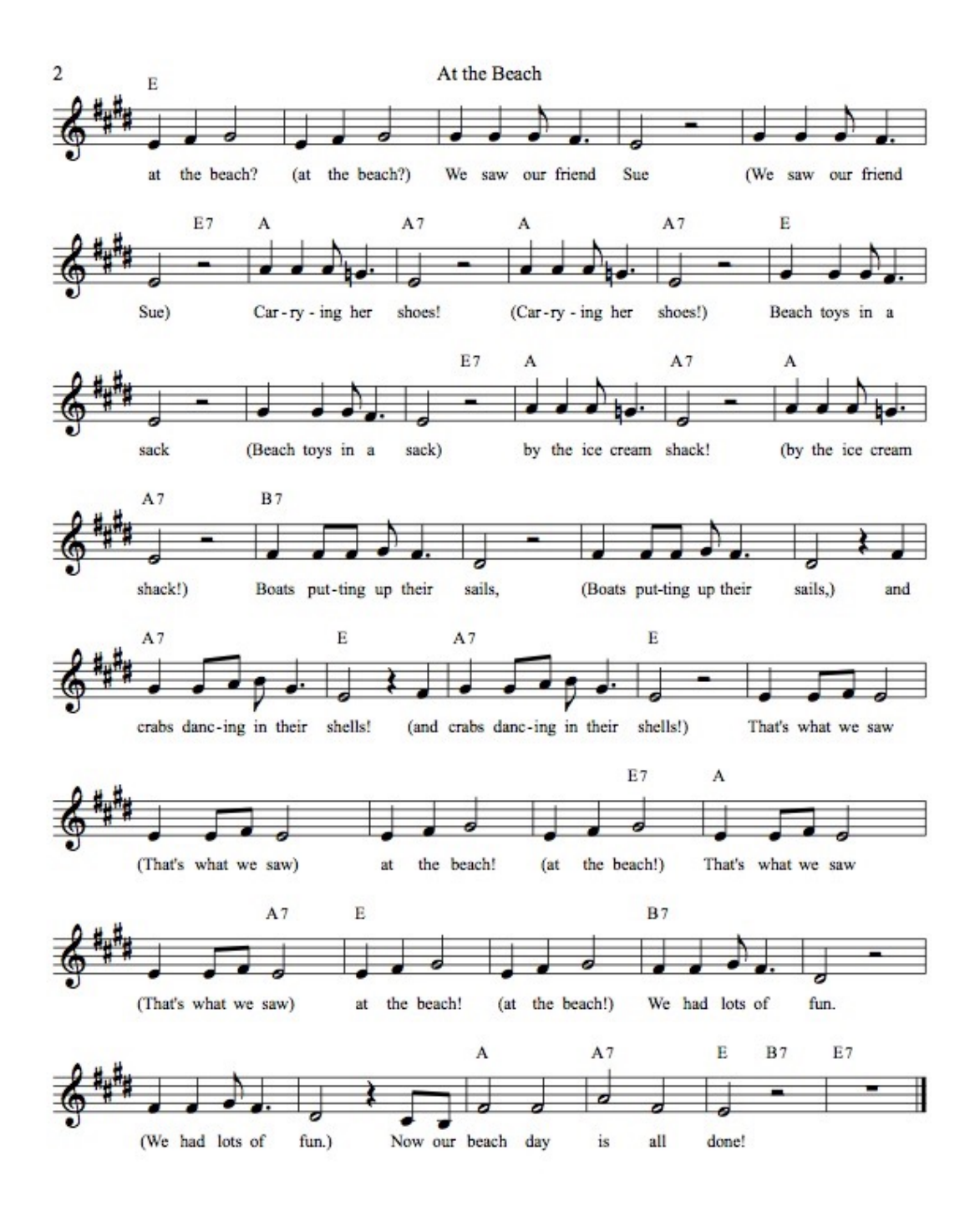
Figure 2 . Example song composed for music therapy treatment of a phonologically-based developmental SSD.